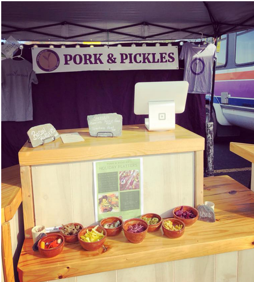
Pork and Pickles Farmers Market Display