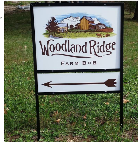
Woodland Ridge vinyl sign image increases brand awareness while providing helpful directions