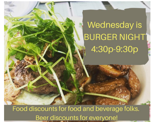
Burger night photos courtesy of the Kitchen at Devil's Kettle using local Dexter Run Farm pasture grazed cattle

The types of marketing materials and merchandise suggested by the producers and retailers included the following categories and items.