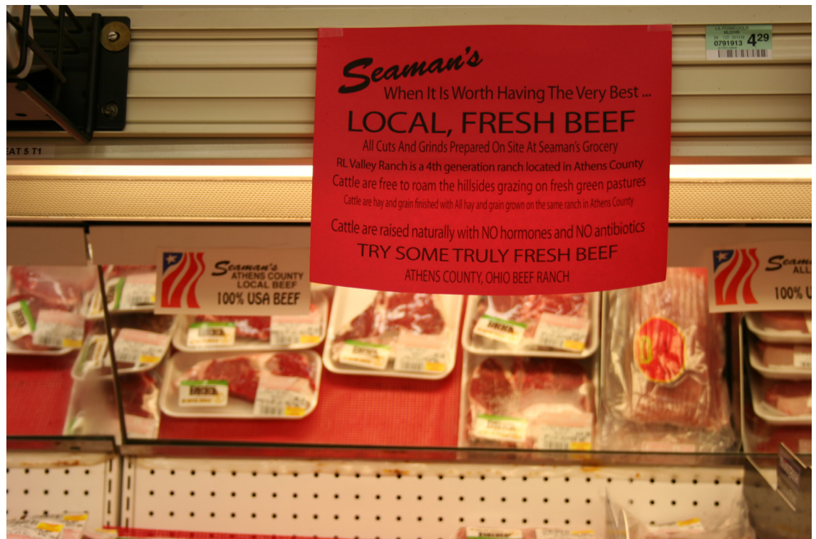
Point of Purchase signage at the Butcher and Grocer, Columbus Ohio