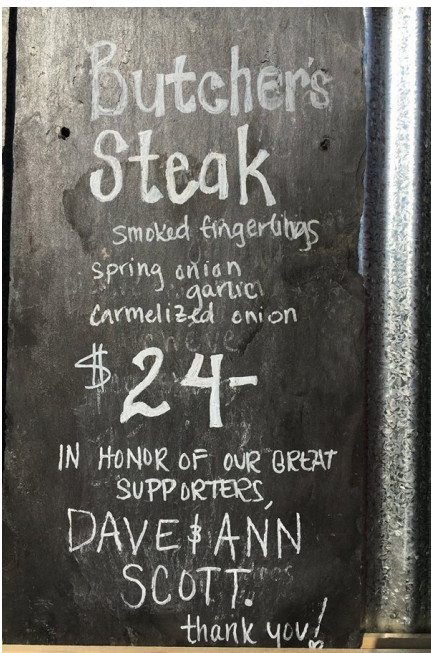
Chalkboard image from the Kitchen at Devil's Kettle, sourced from Dexter Run Farms pasture grazed cattle. Chalkboards are an easy way to advertise changing specials and are versatile and affordable investments from small business owners